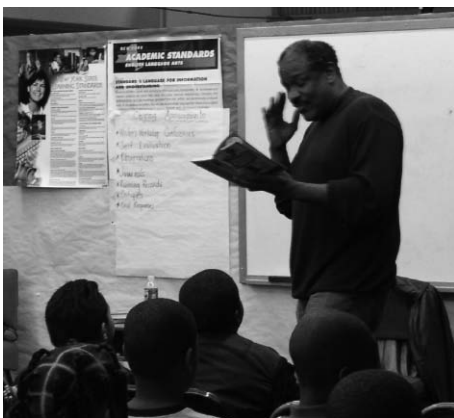
Author Christopher Paul Curtis reads to 15-LOVE participants at Arbor Hill Elementary school.